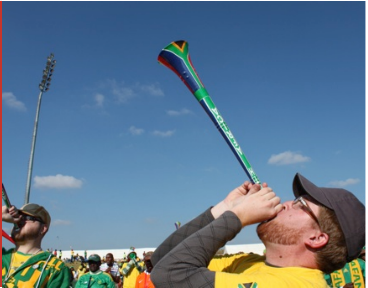
Vuvuzelas: The world's soundtrack this past month!