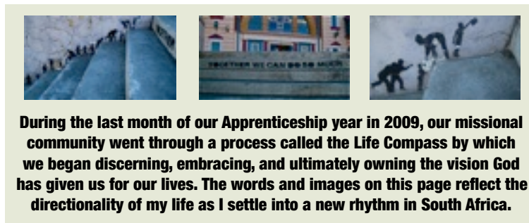
During the last month of our Apprenticeship year in 2009, our missional community went through a process called the Life Compass by which we began discerning, embracing, and ultimately owning the vision God has given us for our lives. The words and images on this page reflect the directionality of my life as I settle into a new rhythm in South Africa.

::: [My vocational calling is to form the Church to discern & engage their vocation in community for the world.] :::